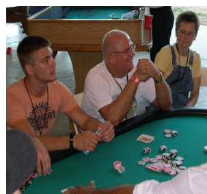
Everyone is a winner at AFI Casino Night!