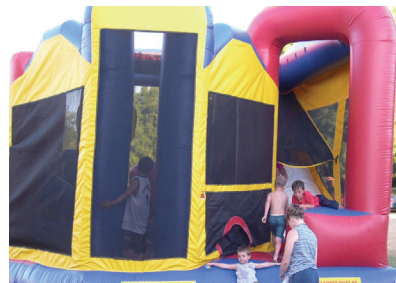
The kids bounced despite the heat!