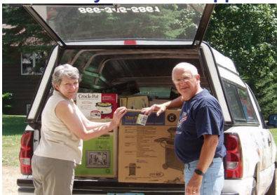
The prize patrol unloads!