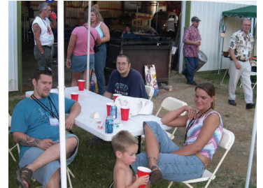
Chillin' in 98 degree heat