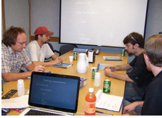
Inspection Certification classes teach employees of requirements