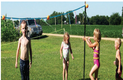
Ahhh! Cool & refreshing