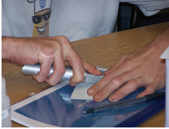
Employees learn the tools of the trade in checking the powder adhesion

A company can go two directions when it comes to quality costs. One direction is that it can expend dollars by reacting to customer rejects or the other direction is that the company can invest dollars proactively by eliminating customer rejects. Associated Finishing chose the latter direction. They did this by utilizing basic testing methods that are standard in the coatings industry and including personal accountability for quality. The whole process of introducing this change came through the training of supervisors, lead people, and key shop personnel from the plant.