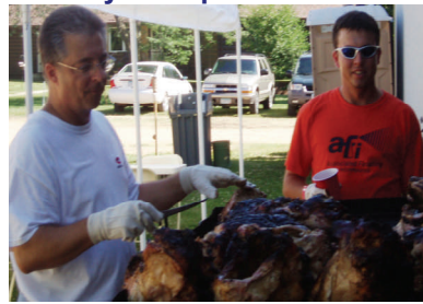
Hog roasts are delicious!